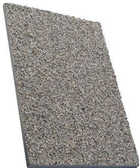
Gray Granit 1