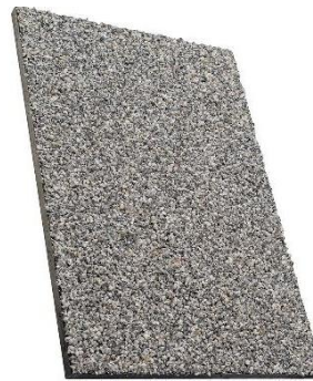
Gray Granit 3