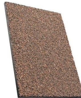
Red Granit 3