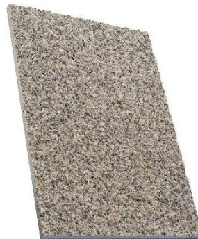
Gray Granit 2