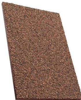
Red Granit 1